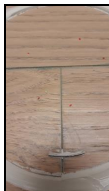
New SUMMIT collection (1,5mm bevels)